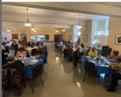
PTT in Cleveland, OH