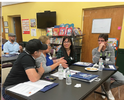
PTT in Clearwater, FL