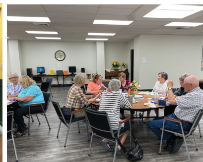
PTT in Logan, UT

Project Talk events come in all shapes and sizes. Can you recruit 25-50 underserved individuals? Apply to host an event!