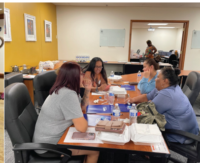
Kansas City, KS