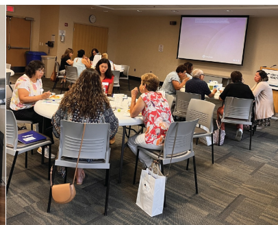
Silver Spring, MD